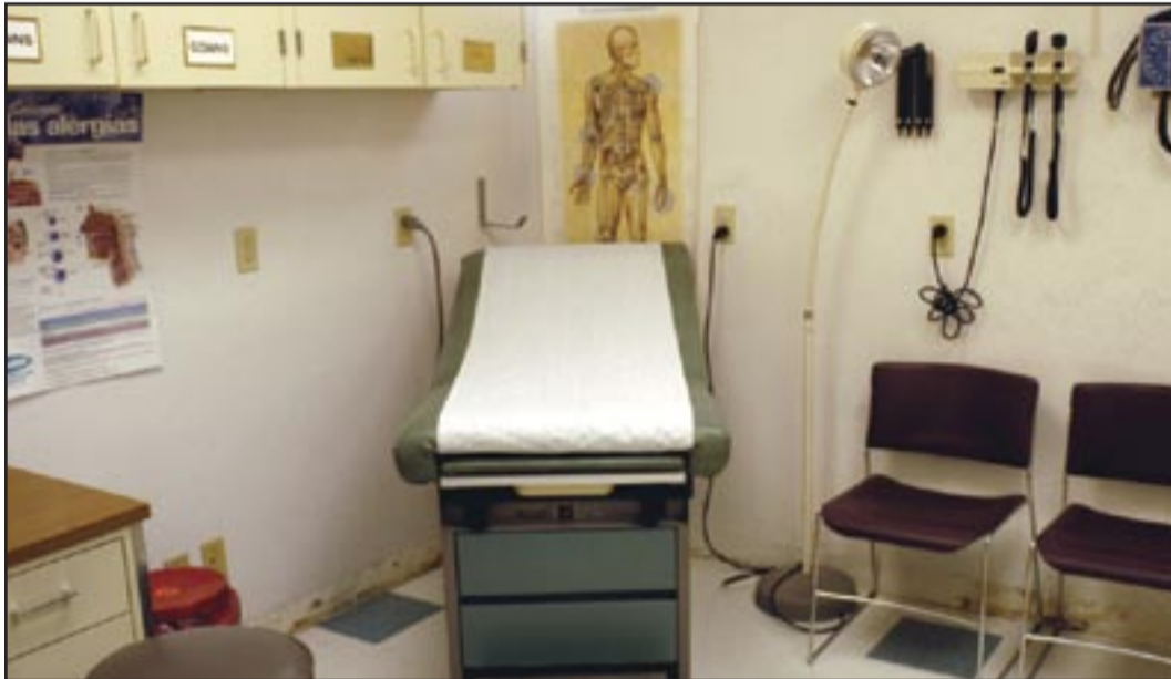
The Valley Family Care Center (VFCC), meets the stringent standards established by the Joint Commission for Accreditation on Healthcare Organizations.

He said both centers have direct accessibility to the El Centro Regional Medical Center for admission of patients, the facilities of its laboratory, its Medical Imaging Department, Pediatrics or for transfer to the Emergency Department. The clinics accept Medicare, Medi-Cal and most private insurances. The staffs at both clinics also are bilingual and are able to translate between English and Spanish if needed.